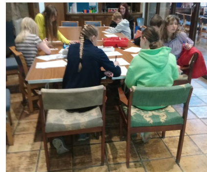
Sunday School fun