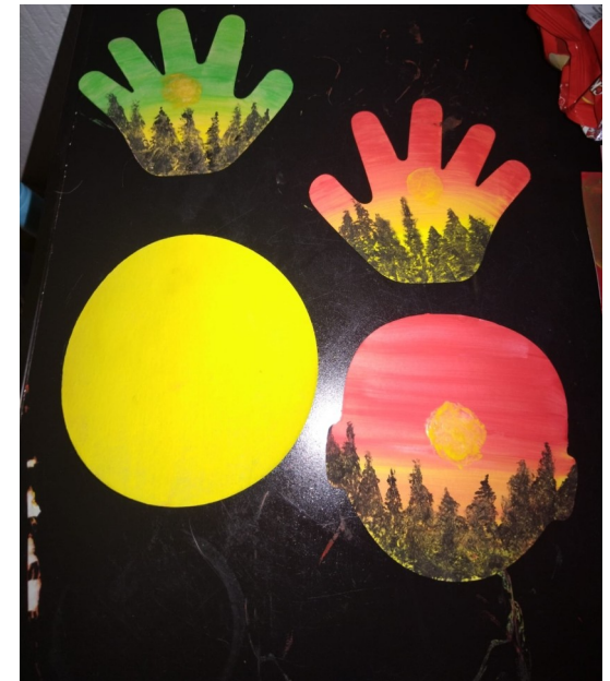
Stunning Harvest pictures from Alisha