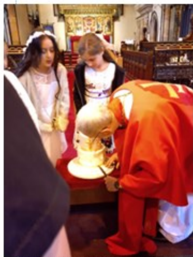
Fun at the Confirmation and Ascension Day Workshops